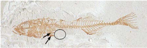
Fossil stickleback without pelvic spines. (The circle shows the region where you would expect to see the pelvis and pelvic spines; the arrows point to the ectoacoracoid bone, which is not part of the pelvis.)

6. You are studying stickleback fossils from a newly discovered desert deposit site that was once the bottom of an ancient lake. Sediment, mineral, and topographical analysis indicate that when the lake first formed it was connected to the ocean by a river that eventually dried up, cutting the lake off from the ocean. As you sort through different rock layers in this desert deposit, you find two distinct types of stickleback fish fossils—those with no pelvic spines and those with full spines. You don't find any fossils of large predatory fish in this deposit.